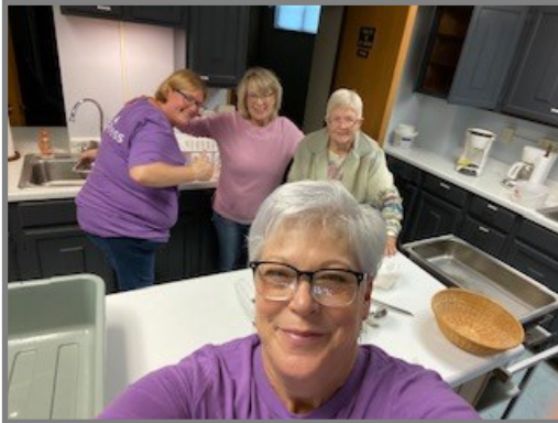
Grubby Sunday was Sunday, September 8, 2024

Our Vision: A Christ-centered, serving community.