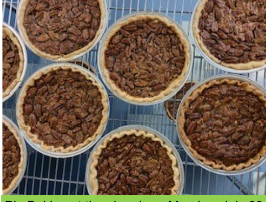
Pie Baking at the church on Monday, July 22 was a great success and a lot of fun!