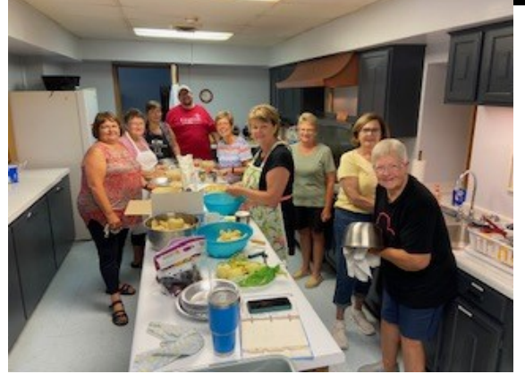
Baking pies at the church. The church was filled with the smell of baking pies.

Our Vision: A Christ-centered, serving community.