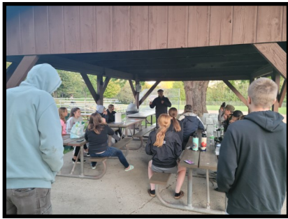
Confirmation Volleyball at Summit Park

Our Vision: A Christ-centered, serving community.