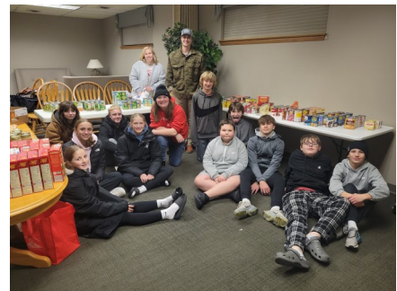
Thanksgiving Meal Baskets Food Collection