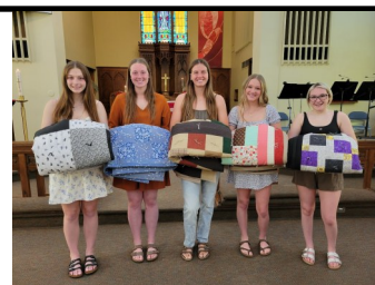
Graduate Quilt Sunday