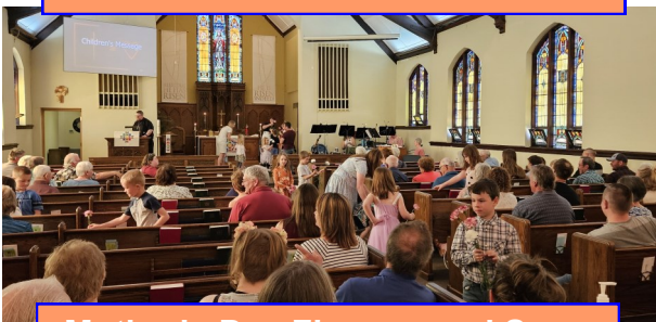
Mother's Day Flowers and Song