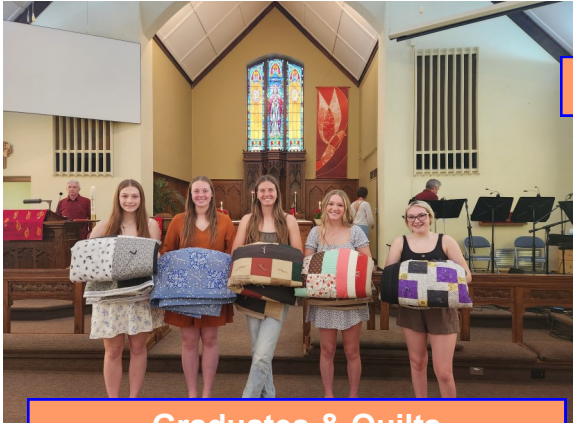
Graduates & Quilts