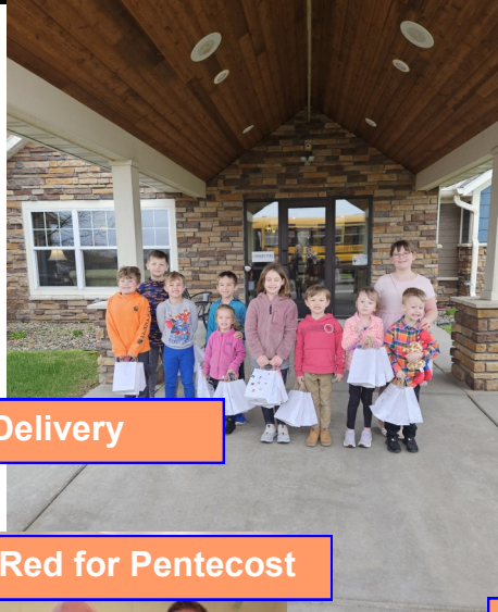
Red for Pentecost