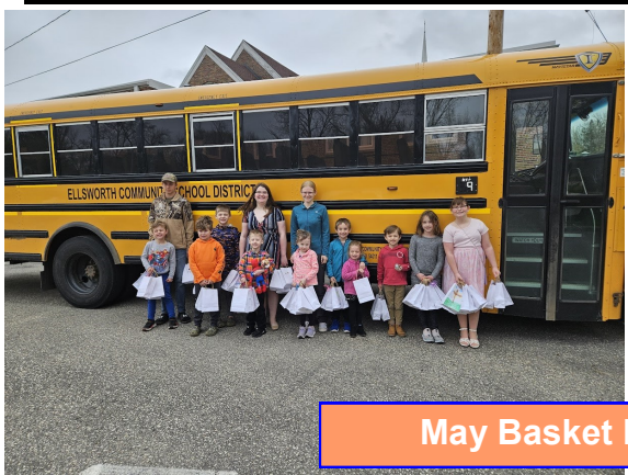
May Basket Delivery

Our Vision: A Christ-centered, serving community.