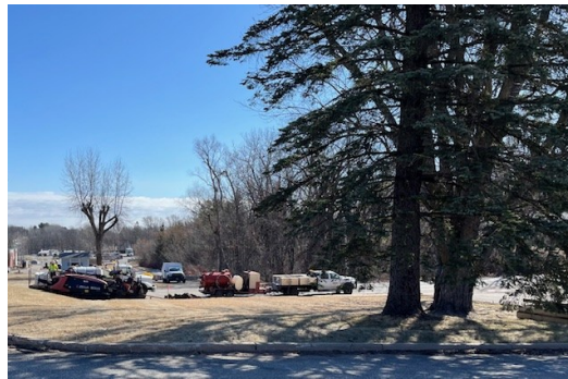
Piety St. project work has begun. Lots of activity by the church.