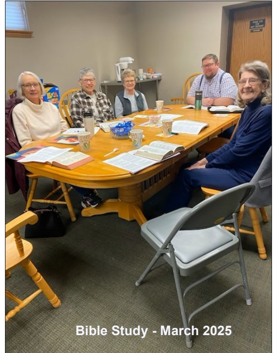
Bible Study - March 2025